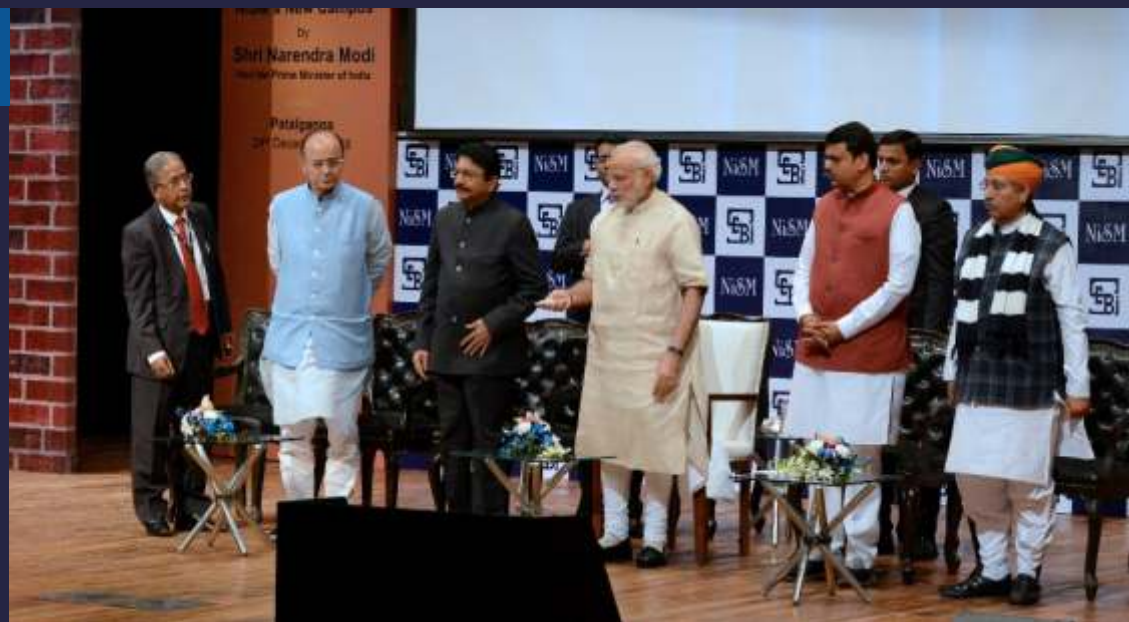
Inauguration of NISM's state-of-the-art Campus at Patalganga by Shri. Narendra Modi, Hon'ble Prime Minister of India.