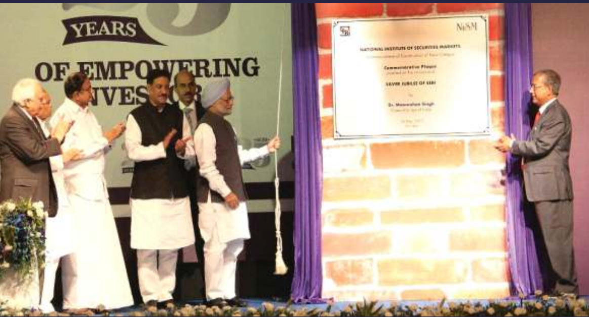
Commemorative plaque of commencement of construction of NISM campus by Dr. Manmohan Singh, Former Prime Minister of India.